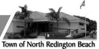
Town of North Redington Beach

www.TownofNorthRedingtonBeach.com November 2009